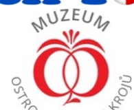
Muzeum Ostravský lidových krojů